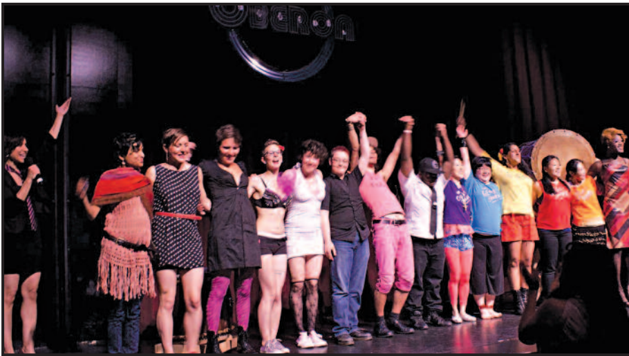
Performers at the 2013 Paint The Town (La) Red.