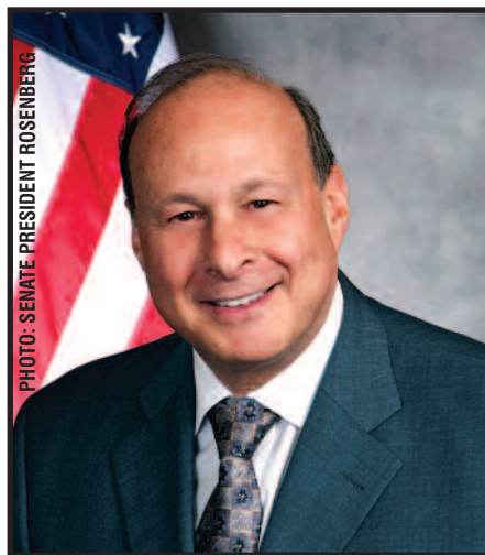
Massachusetts Senate President Stan Rosenberg

Recommendations in the 70-page report included advising state agencies to collect data on gender identity and sexual orientation on a routine basis to track how LGBTQ