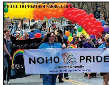
NOHO Pride parade in Northampton, Mass. last year.

"From a small march with speeches between Jacque's Cabaret and City Hall, to